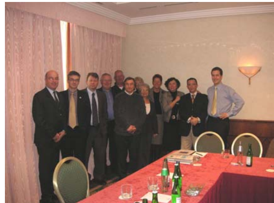
The PPUG members

During the meeting in Prague it was also possible for PPUG – the Plasma Protein Users Group – to meet. This used to be haemophilia and primary immunodeficiency but now it includes many others – Alpha1, GBS, ITP, and as users of Ig we all work together to make sure that WHO re-instate this onto their List of Essential Medicines.